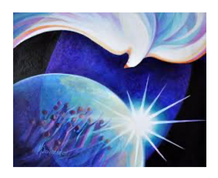
Sunday, May 19, 2024 8 am & 10 am Holy Communion